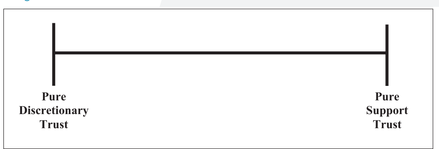
Diagram 1 Undefined Continuum

Prior to the U.T.C., the analysis of the above fact pattern in virtually every state was incredibly simple. The discretionary trust does not create an enforceable right or a property interest; it is a mere expectancy. Due to the high threshold for the judicial standard of review for a discretionary trust,<sup>24</sup> a beneficiary does not have a right